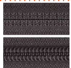
Coil Fire Retardant Covered Pockets Stationwear