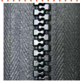
Vislon Nomex FR PU Turnout Coats Water Repellant Tape